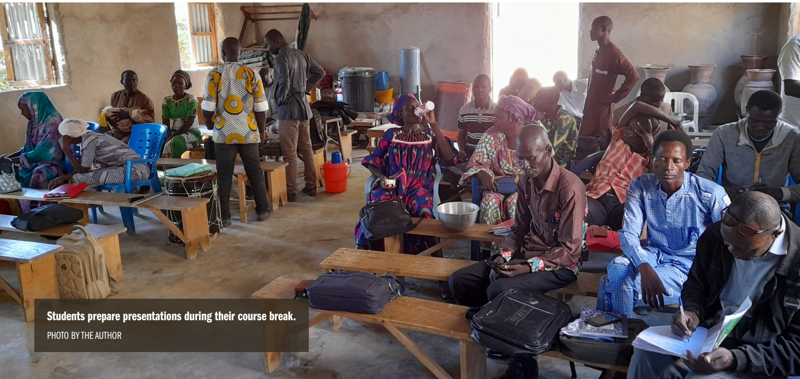
Students prepare presentations during their course break.