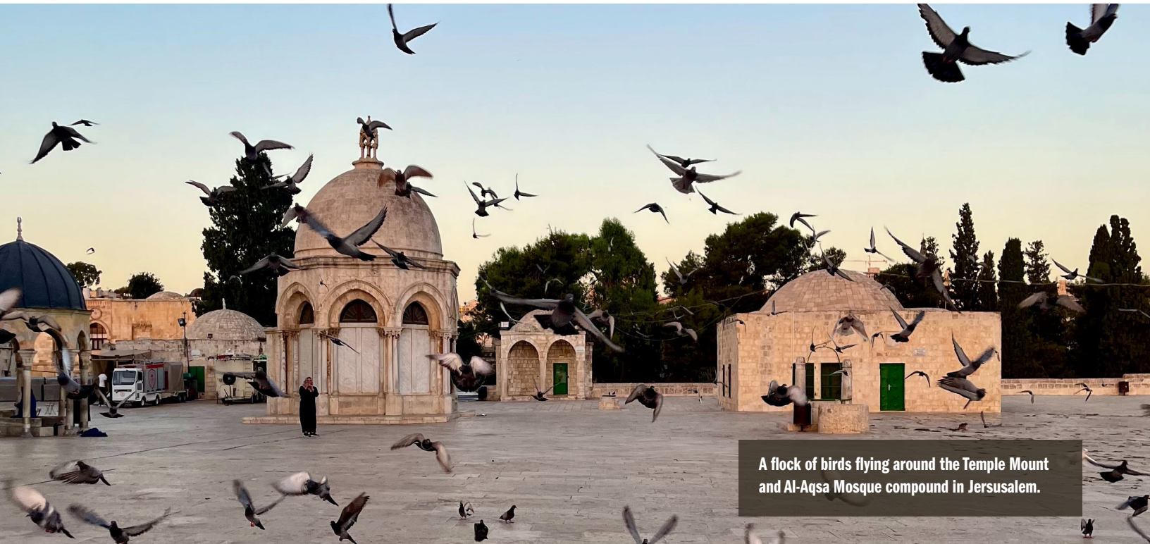
A flock of birds flying around the Temple Mount and Al-Aqsa Mosque compound in Jerusalem.