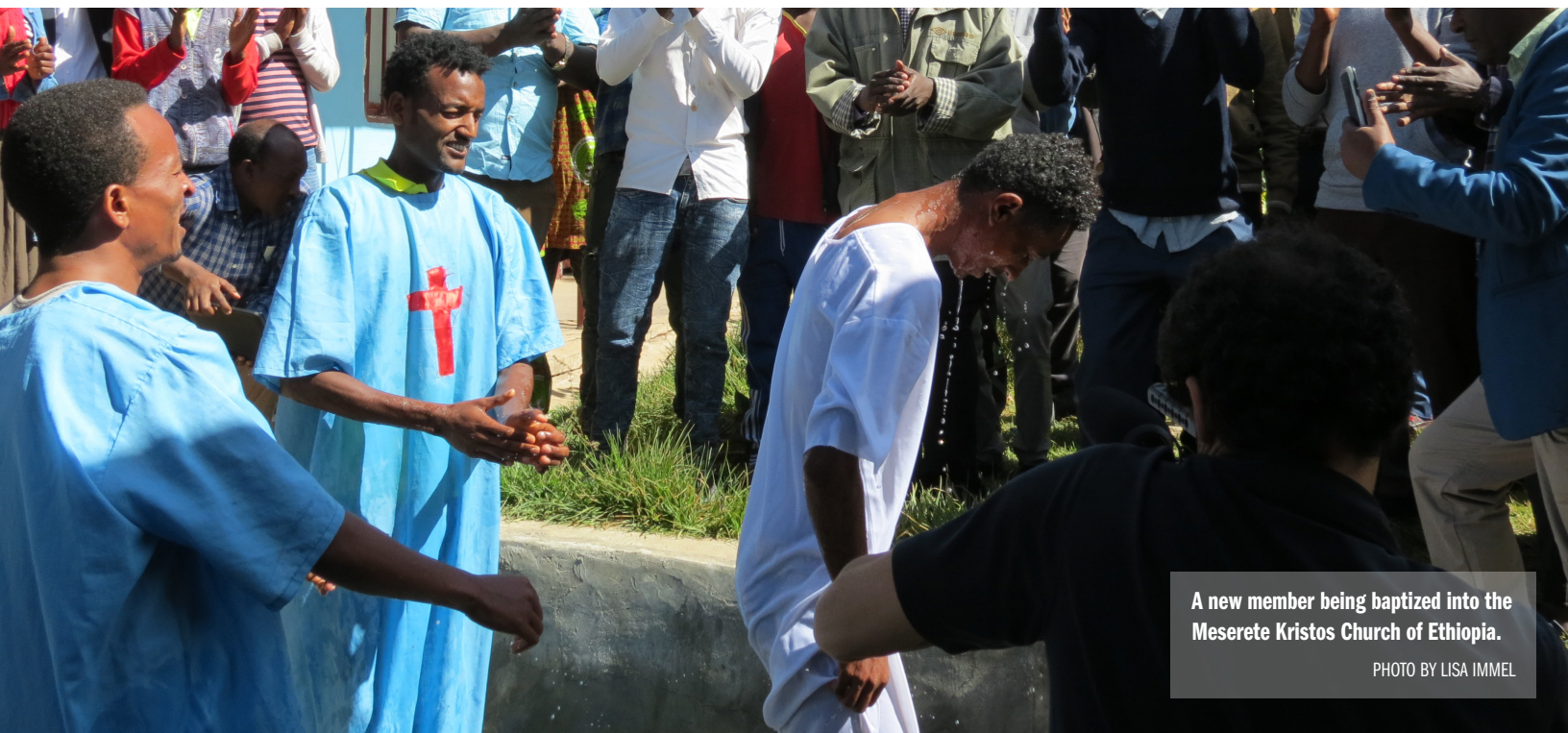
A new member being baptized into the Meserete Kristos Church of Ethiopia.