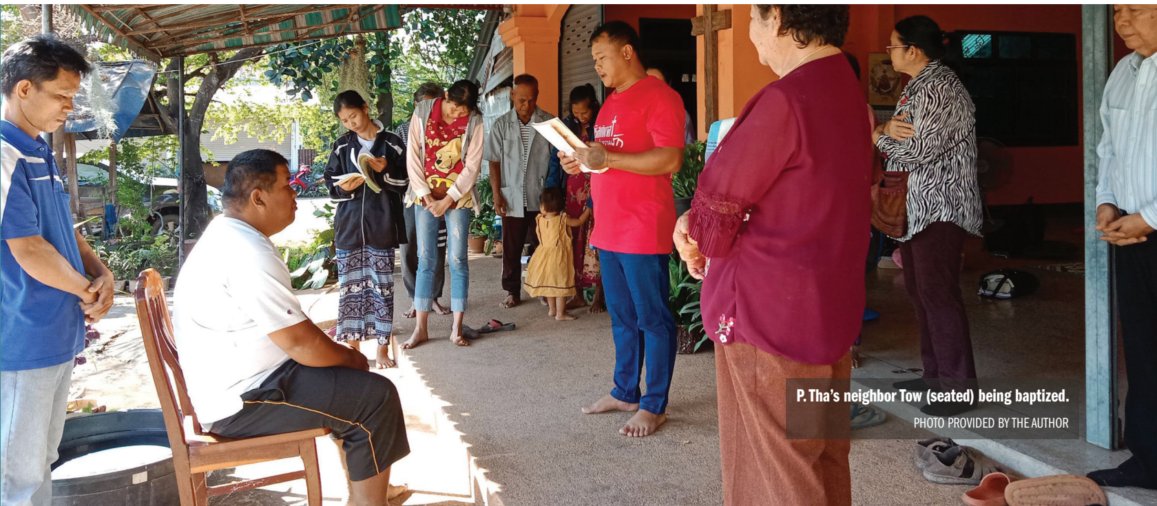
P. Tha's neighbor Tow (seated) being baptized.