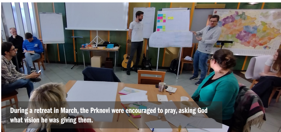
During a retreat in March, the Prknovi were encouraged to pray, asking God what vision he was giving them.