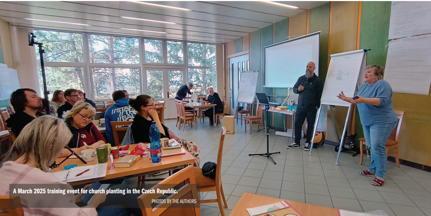
A March 2025 training event for church planting in the Czech Republic.